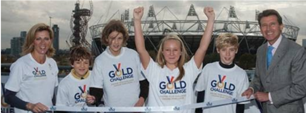
Lord Coe and Sally Gunnell launch Gold Challenge Olympic Stadium event

Members of the public will get the chance of a lifetime to be the first to run in the Olympic Stadium through Gold Challenge, part of Sport England's mass participation legacy programme, Places People Play .